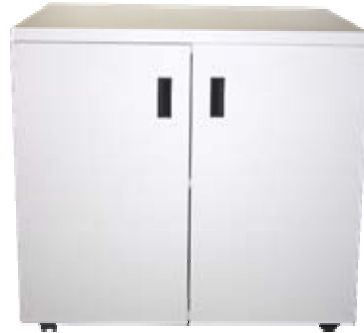
2' Vertical Stacker & Cabinet Shown on 15K

FORMost Graphic Communications, Inc. 7654 Standish Place Rockville, MD 20855