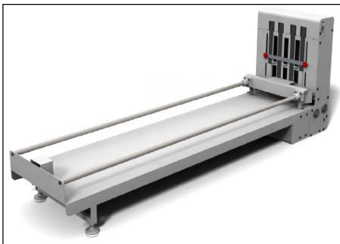
4 foot model

The PSMailers Conveyor/Stacker is completely manufactured in the United States and its durability is unmatched in the industry.